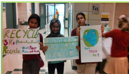
Student Leadership Club students become ambassadors of Sustainability at MS194.

Share the Love- Find one or two interested faculty members who would be interested in taking on this new responsibility. If you have the title of sustainability coordinator, that doesn’t necessarily mean that you have to take on the responsibility of running the green team yourself. Finding more than one faculty member creates a larger support system and allows the responsibility to be shared.